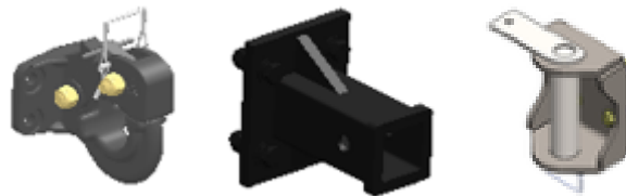
Bolt-On Pintle Hitch, Receiver Hitch and Tow Pin